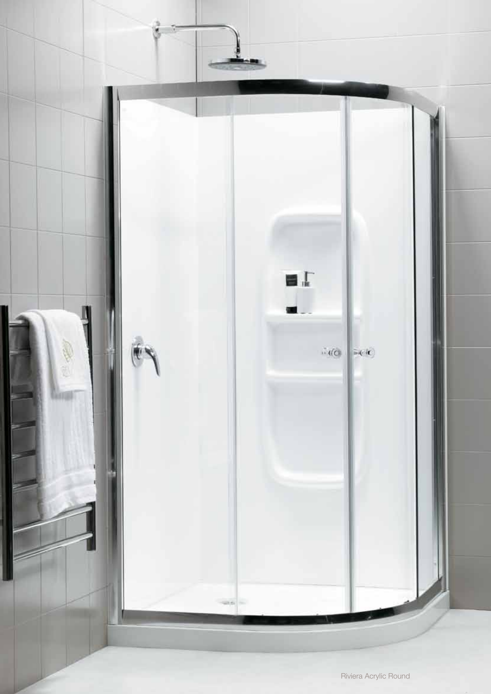
Riviera Acrylic Round